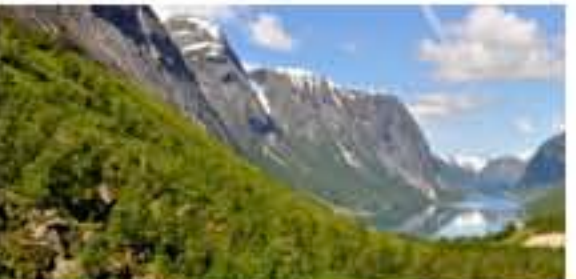
EU Norwegian Fjords