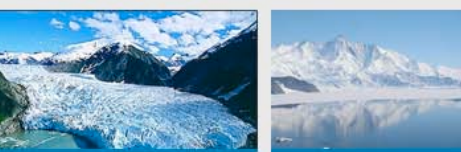
Alaska & Canada West